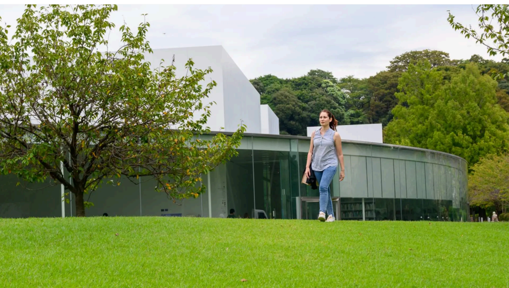
A contemporary art museum packed with interactive exhibits

This art museum, which has a collection of contemporary art, boasts some of the highest visitor numbers in the country. Many of the permanent exhibits are interactive, with the viewer becoming part of the entire work, stimulating the senses.