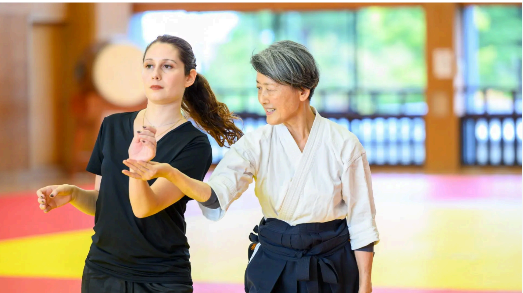
Experience "strengthless" Aikido

Aikido is a "martial art without fighting." For women who are interested in martial arts but feel it is too difficult for them to try, Aikido is a martial art that does not require physical strength or strength.