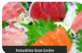
Hatsushima Asian Garden

variety of cafes and sweets made from local ingredients, all of which are highly popular. You can savor Atami's gourmet cuisine here.