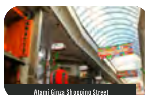
Atami Ginza Shopping Street